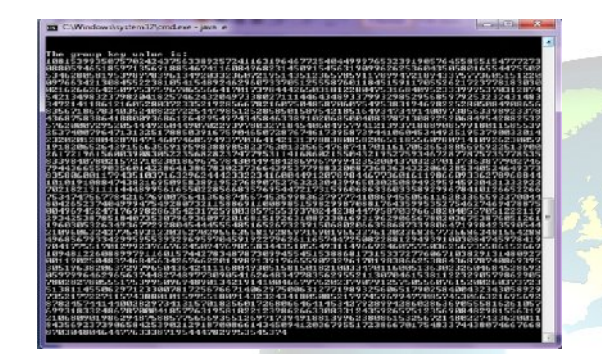
Fig.4 Group key derivation of ElGamal 4.5 Encryption

Fig.4 shows the derivation of the group encryption key. The group encryption key is derived from each user public key values. The message to be sent is encrypted only by using the group encryption key.