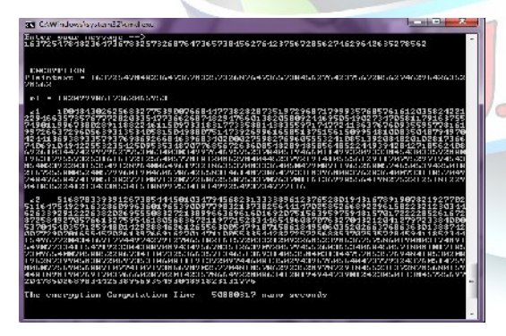
Fig.5 Encryption of ElGamal

Input : message, r value, group key value and M value. Output: calculates the z_1 and z_2 value.